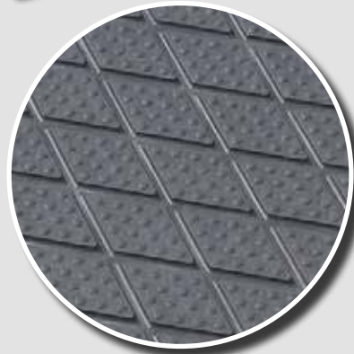
Anti-slip diamond upper side