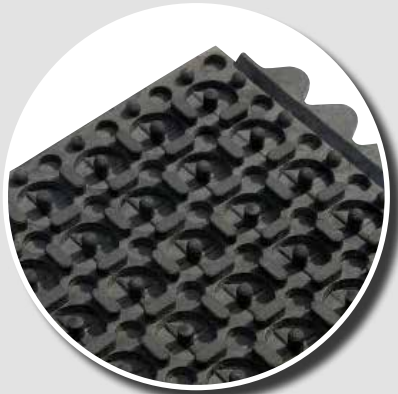
Draining lower side